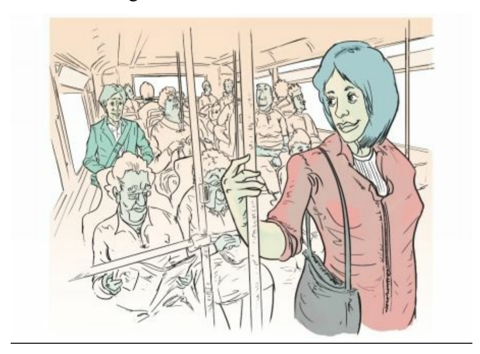
She was riding the bus when she first saw him.

Here, the process of her riding the bus began before the narrative event that is being described – the occasion that she saw him.