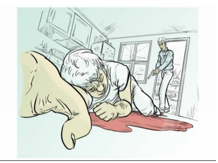
Jim arrived at the crime scene. He found a man who had been shot.

The past perfect is used in storytelling to provide background information. Main narratives in the past are usually in the simple tense, so the past perfect can provide details of events that happened before the main narrative .