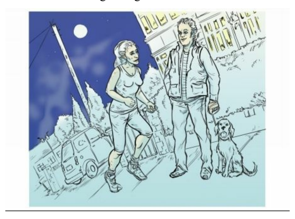
"I have been running all night."

The present perfect continuous would be more appropriate closer to the event – in the