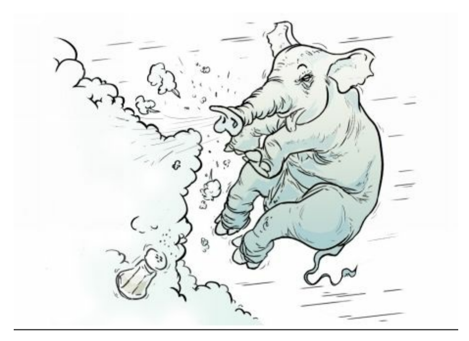
Elephants sometimes sneeze.

To demonstrate schedules or specific times, a time may be placed after the verb, with frequency adverbs such as every or most .