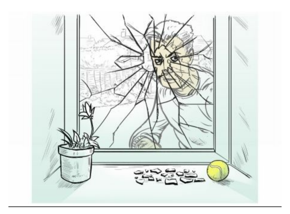
The window had been broken.