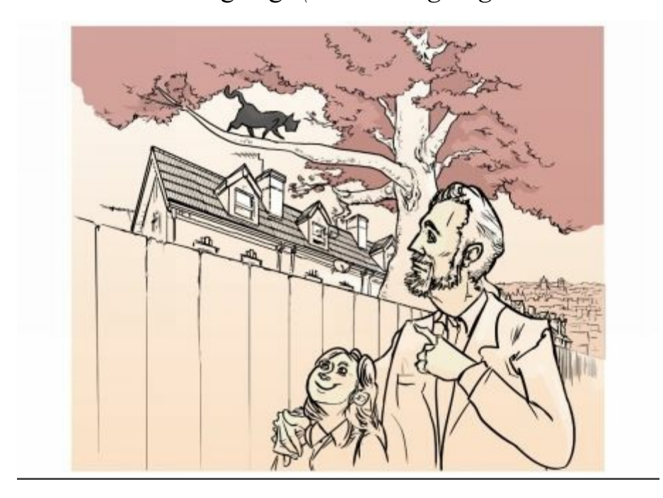
"Where is that cat going?"

The present continuous is often taught as something happening now , but it may be a repeated event or an interrupted process that takes place in a period of time including now. The time of the sequence may include now, even if the actual action or event is not currently occurring.