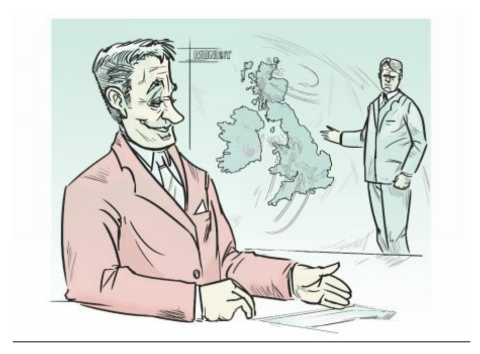
"It's going to rain all night."