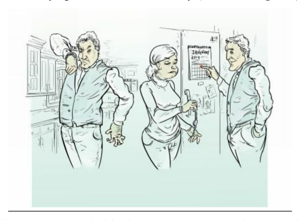
"I'll buy a new watch." / "I'm buying a new watch on Tuesday."

These differences mean going to and the present continuous are often used for future events that are decided or arranged in advance; will is used for more recent decisions.